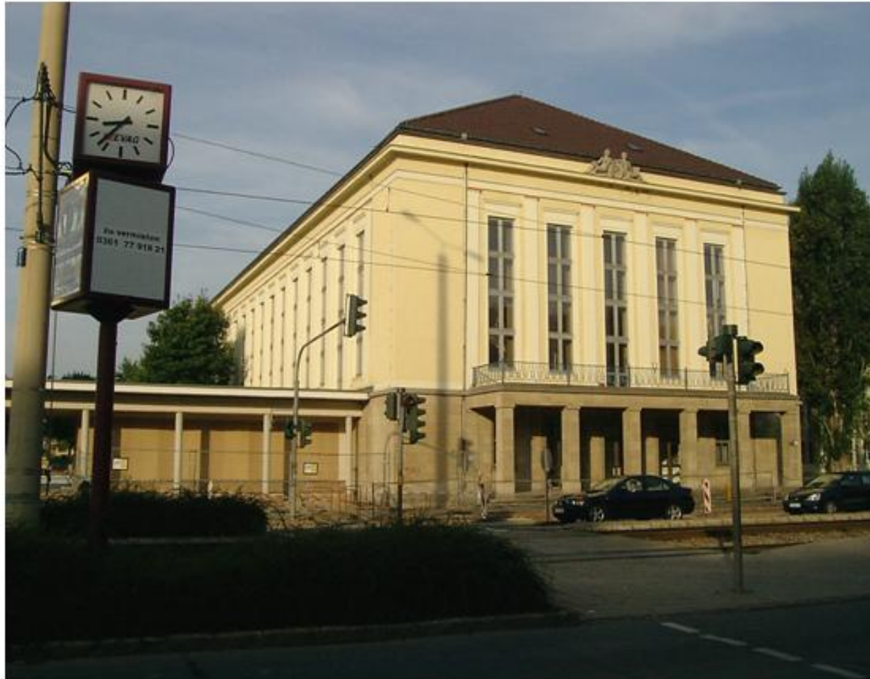
H Building 1 Auditorium Maximum - View from the tram stop „University“ (Universität) No 3, 6